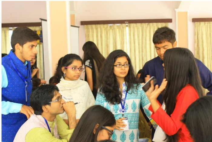
M.P.'s lobbying to make consensus.