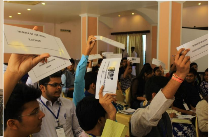
M.P.'s during voting on a bill.