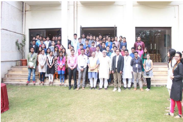
Guests with all the participants