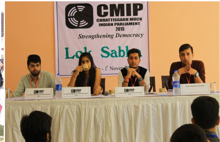
Executive Board of the Lok Sabha