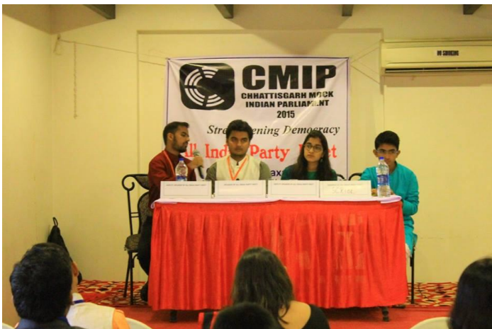
Executive Board of AIPM